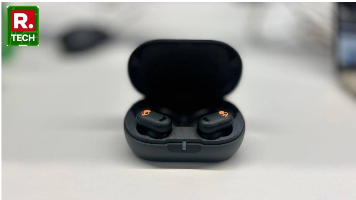
Skullcandy Push ANC Active TWS Buds

Earbuds For Gym Lovers: Skullcandy recently launched Push ANC Active, its new true wireless earbuds for the Indian market, featuring an ear hook design, a rugged build, and an active noise-cancelling feature. The company claims its new ANC earbuds can maximise the listening experience. We tested whether that is true and answered the question: Should you buy the Skullcandy Push ANC Active at a special price of ₹9,999 (the original price is ₹34,999)?