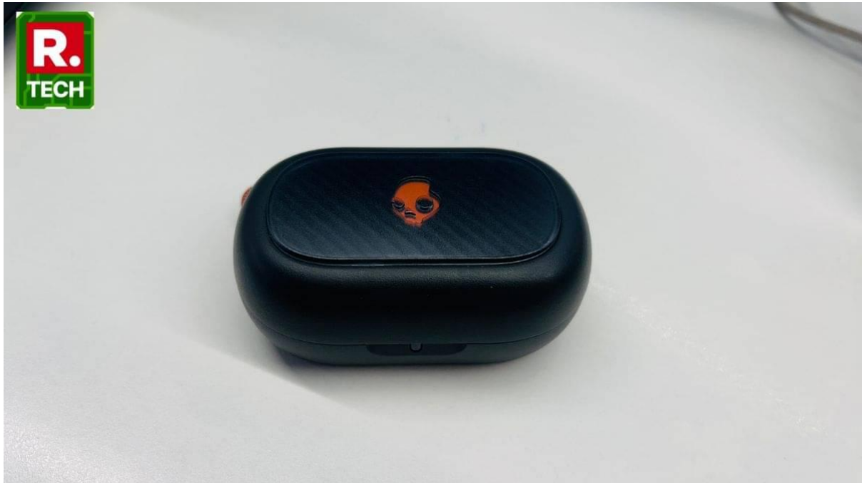
Skullcandy Push ANC Active Charging Case, Image Source: Republic Tech

A major con of the Skullcandy Push ANC Active is the case's size. It is too big to shove into the jeans pocket, and if done, it protrudes outside, making it difficult at times. The big size of the charging case can be a deal-breaker for multiple buyers.