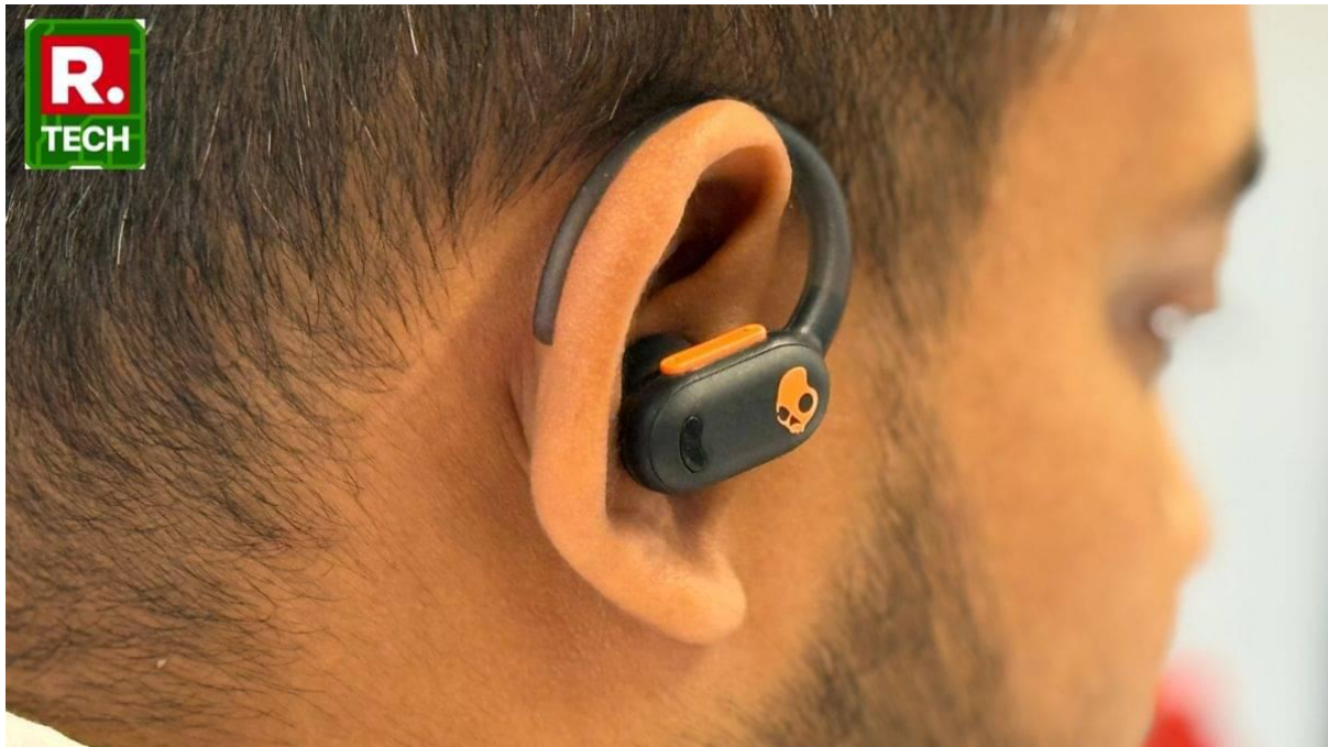
Skullcandy Push ANC Active Rocker Button, Image Source: Republic Tech