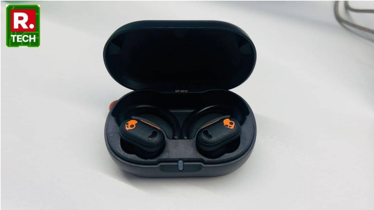
Skullcandy Push ANC Active