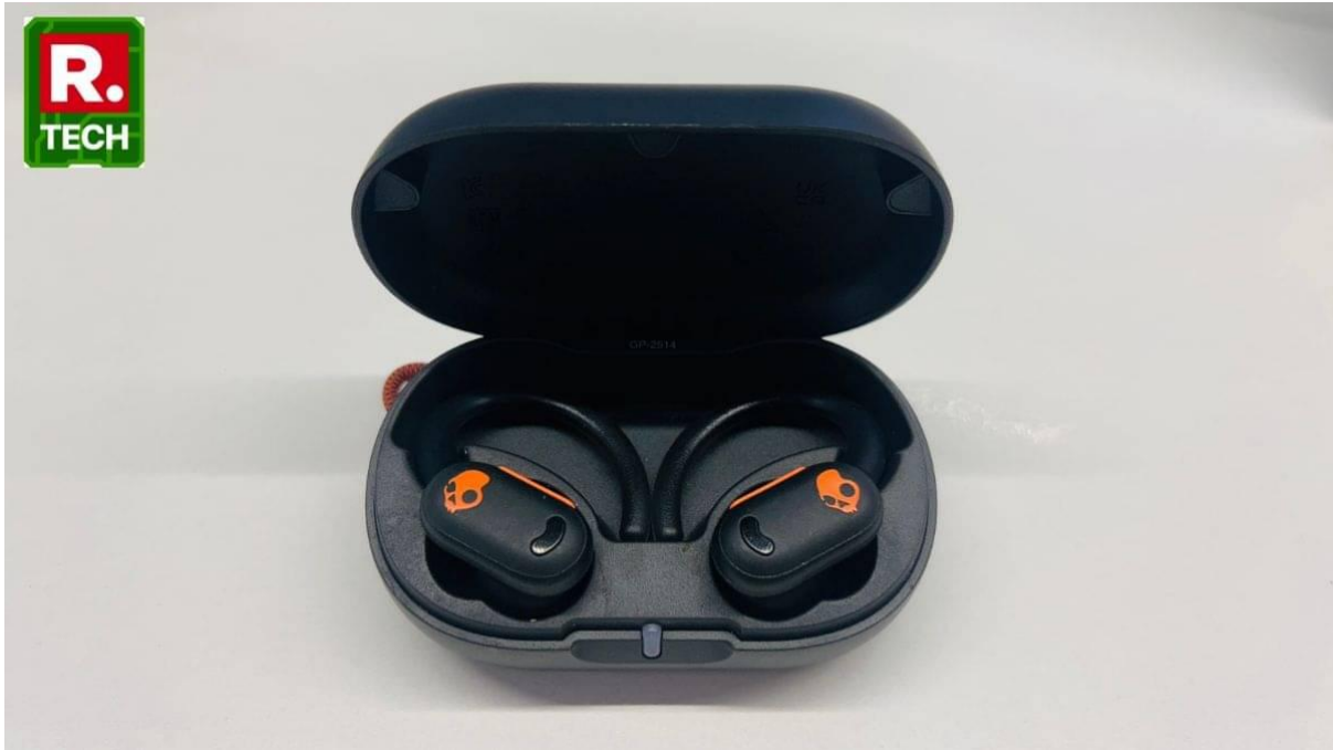
Skullcandy Push ANC Active Battery Indicator, Image Source: Republic Tech