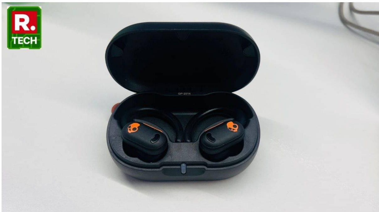
Skullcandy Push ANC Active Case

The sound quality was good, but it could have been slightly better and more refined for clearer audio. That is because the sound has no distinction among instruments in a song. However, the bass was mostly good for our liking, and in some songs, the notes from the musical instruments were clear.