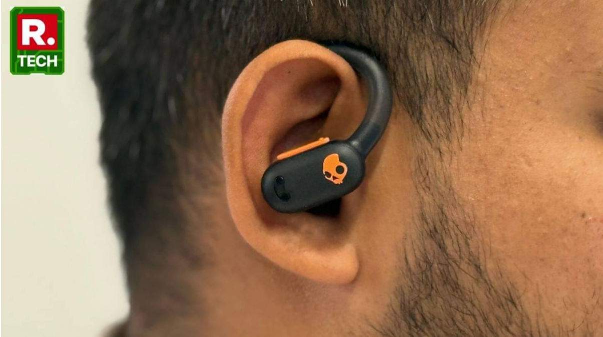
Skullcandy Push ANC Active Fitting on Ears

The sound quality was good, but it could have been slightly better and more refined for clearer audio. That is because the sound has no distinction among instruments in a song. However, the bass was mostly good for our liking, and in some songs, the notes from the musical instruments were clear.